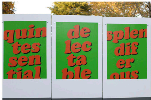
"Pleasure's Promise" at Culture House.

Sat, 24 October 2020 - Sun, 20 December 2020